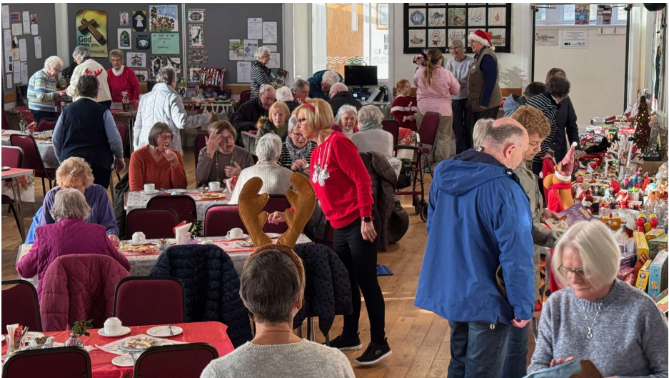
A busy morning at the Guild Coffee Morning and Christmas sale. £936.69 was raised for Guild charities